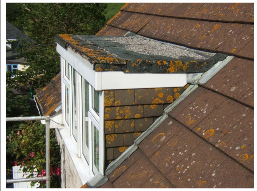
Above, The original felt covering has deteriorated and leaking badly.