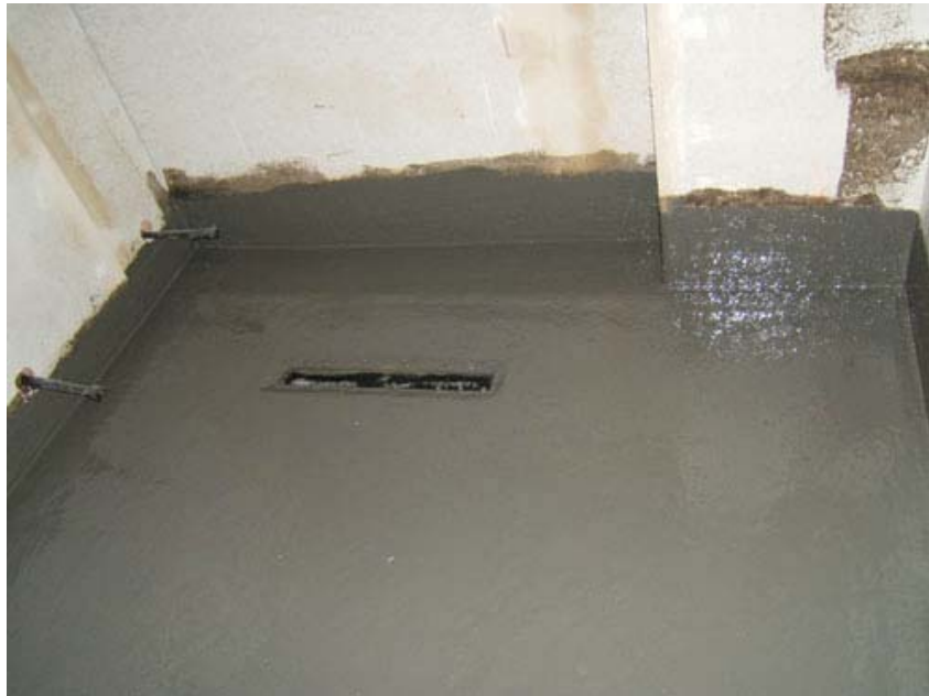
Above: GRP Wet Room System installed.

We now offer a GRP Wet Room System, which is ideally suited to waterproof sub floors prior to tiling.