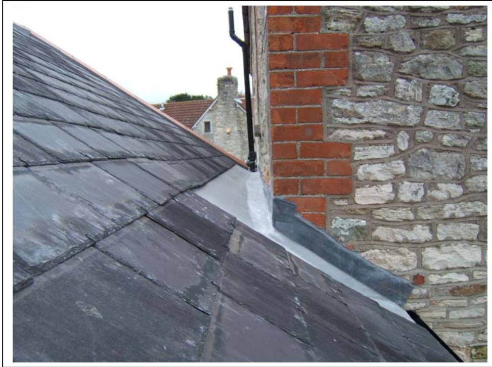
Above: an awkward back gutter abutment

One of G.R.P.'s greatest properties are that once again, it can easily cope with awkward steps returns, created a seamless watertight seal.