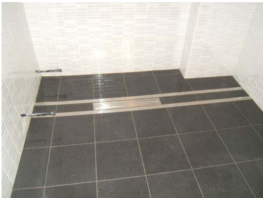
Above: then tiled.... suitable for bathrooms, toilet floors and wet room insulations.