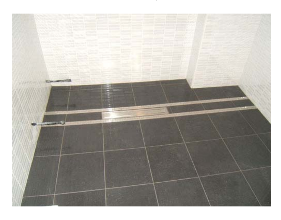
Above: then tiled.... suitable for bathrooms, toilet floors and wet room insulations.