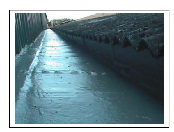
Existing tin/zinc valley lined with 1800 gram lay up of G.R.P. to busy industrial/commercial premises in Glastonbury.