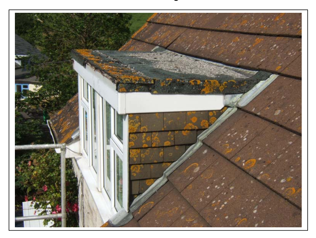
Above, The original felt covering has deteriorated and leaking badly.