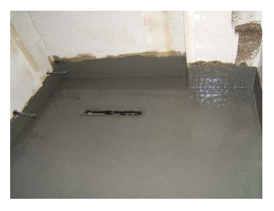
Above: GRP Wet Room System installed.

We now offer a GRP Wet Room System, which is ideally suited to waterproof sub floors prior to tiling.