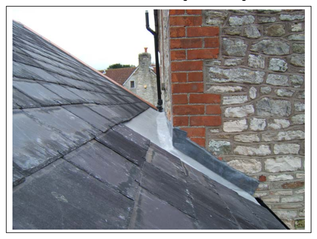
Above: an awkward back gutter abutment

One of G.R.P.'s greatest properties are that once again, it can easily cope with awkward steps returns, created a seamless watertight seal.